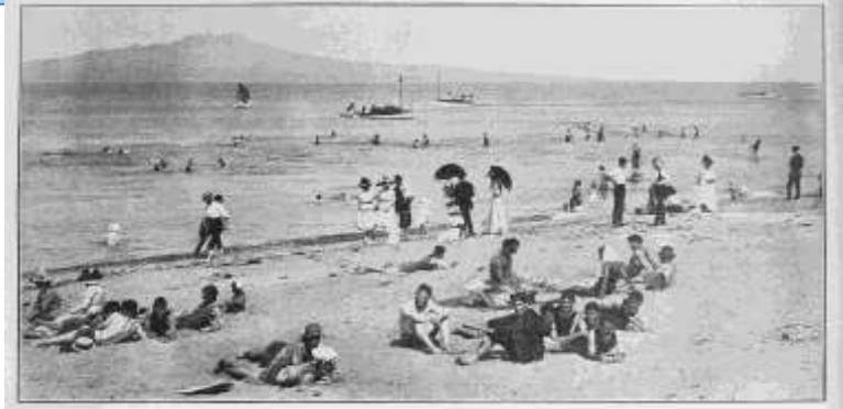
Milford Beach. Auckland Weekly News , 27 March 1913. Sir George Grey Special Collections, Auckland Libraries.

Now here's something completely different for Easter. The community-minded people at the Milford Baptist Church have teamed up with Murray Hill at the Milford Business Assn to create an innovative Easter Art Walk through the Milford town centre.