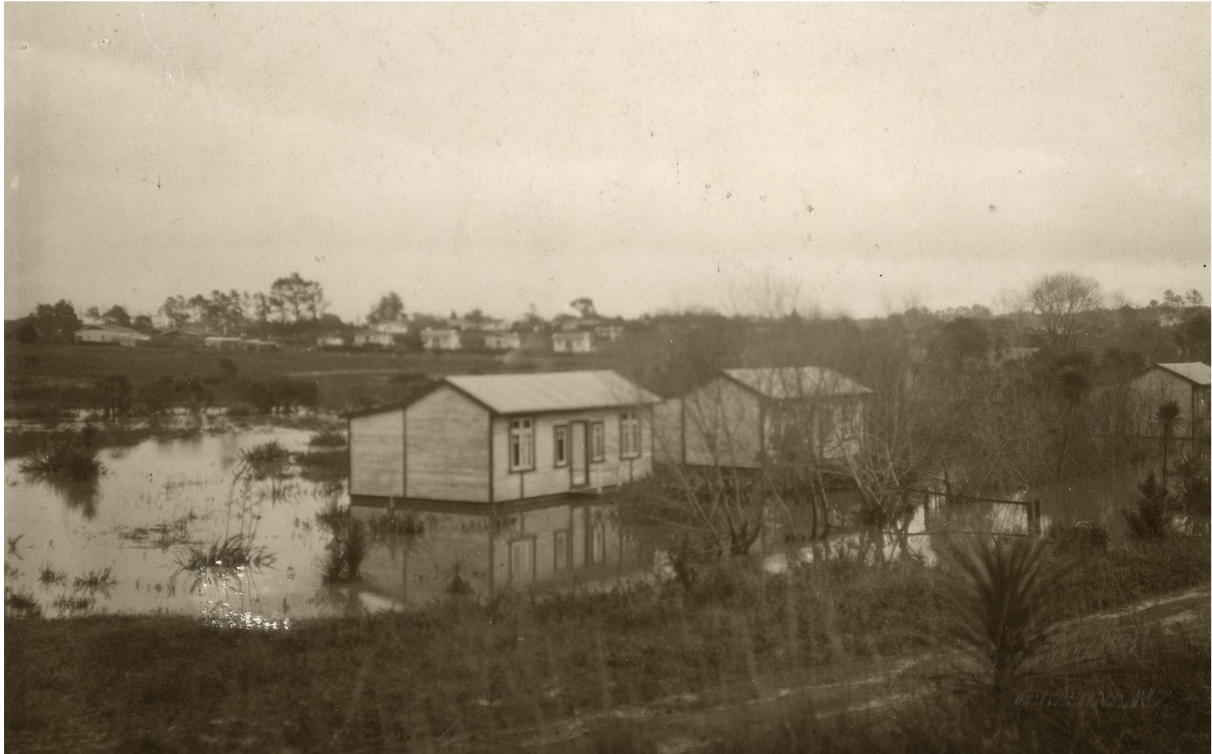
Photo of flooding in Wolsley Avenue, Milford, 23 July 1928. Auckland Libraries, Ref T0812. Photographer: Home Studio.